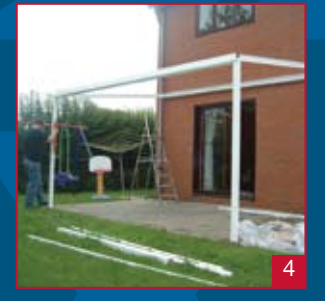
MAIN FRAME ERECTED