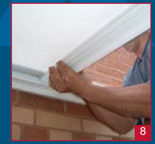
CLIP FIT GLAZING BAR INSTALLATION