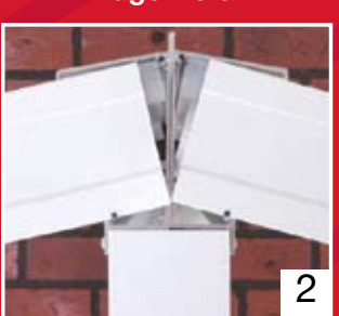
Wall plate back to back forming ridge application