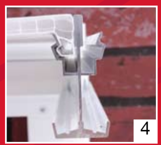
Easy to install Clip-Fit P.C. panels