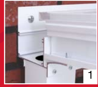
wall as a box gutter