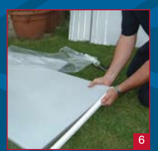
END CLOSURE FITTING