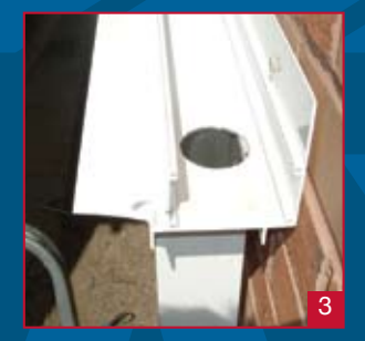
DRILL RAINWATER HOLE