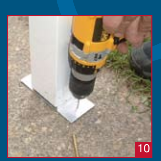
FIX BASE BRACKET