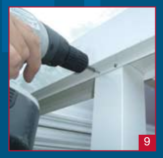
EAVES BEAM FIX TO POST