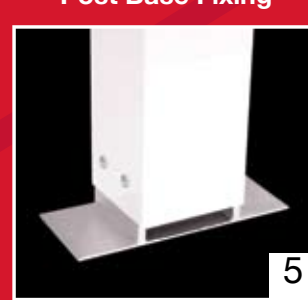
Variable post fixing allows water drainage