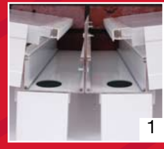
Eaves Beam Gutter in back to back application