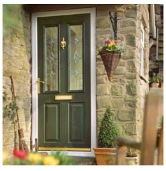
*The mahogany option on REHAU Edge system is non-standard