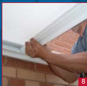
CLIP FIT GLAZING BAR INSTALLATION