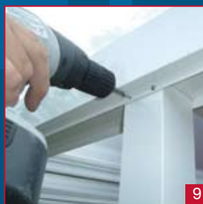
EAVES BEAM FIX TO POST