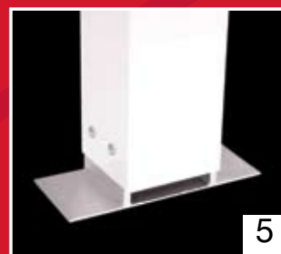
Variable post fixing allows water drainage