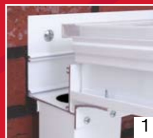
Eaves beam gutter fixed to wall as a box gutter