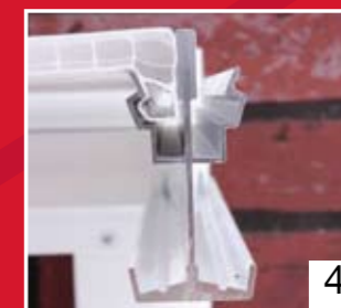
Easy to install Clip-Fit P.C. panels