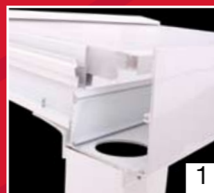
Integral rainwater drainage into post