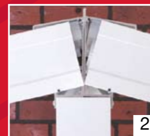
Wall plate back to back forming ridge application