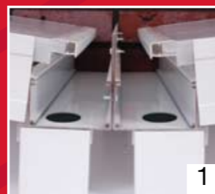
Eaves Beam Gutter in back to back application