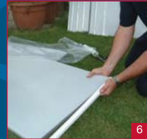
END CLOSURE FITTING