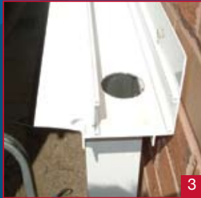
DRILL RAINWATER HOLE