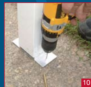
FIX BASE BRACKET