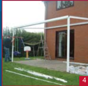
MAIN FRAME ERECTED