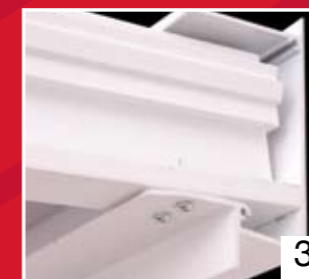
Wall plate fixed to wall