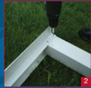
FIX POST TO EAVES BEAM GUTTER